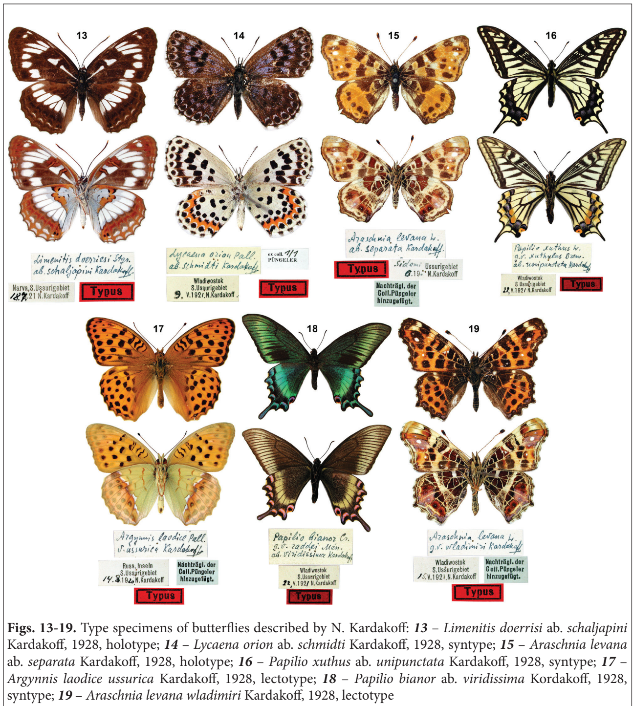
Figs. 13-19. Type specimens of butterflies described by N. Kardakoff: 13 – Limenitis doerrisi ab. schaljapini Kardakoff, 1928, holotype; 14 – Lycaena orion ab. schmidti Kardakoff, 1928, syntype; 15 – Araschnia levana ab. separata Kardakoff, 1928, holotype; 16 – Papilio xuthus ab. unipunctata Kardakoff, 1928, syntype; 17 – Argynnis laodice ussurica Kardakoff, 1928, lectotype; 18 – Papilio bianor ab. viridissima Kordakoff, 1928, syntype; 19 – Araschnia levana wladimiri Kardakoff, 1928, lectotype

Male syntype (fig. 9). Red paper, rectangular, printed: "Typus"; white paper, rectangular, handwritten: "Papilio bianor Cr. | g.v. raddei Mén. | ab. minima Kardakoff"; white paper, rectangular,