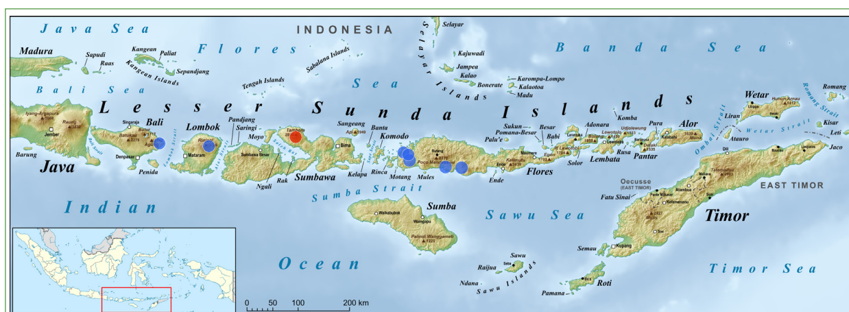
Fig. 3. Distribution records of Cyana sumbawensis : red circle indicates its type locality, and blue circles indicate new records. The base of the map was obtained from: https://commons.wikimedia.org/wiki/File:Lesser_Sunda_Islands_en.png

Рис. 3. Места находок Cyana sumbawensis : красный круг указывает на типовое местонахождение, синие круги — на новые находки. Источник основы карты: https://commons.wikimedia.org/wiki/File:Lesser_Sunda_Islands_en.png